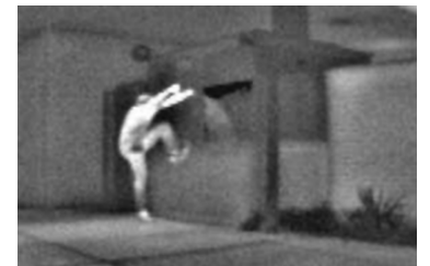
Improve facility security with long-range surveillance.