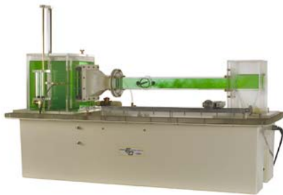
The flowLab is a complete water tunnel that can sit on a sturdy workbench or desk.