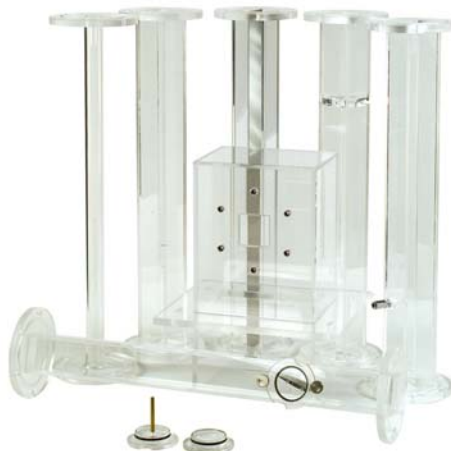
A variety of test sections are available and can be changed in minutes.